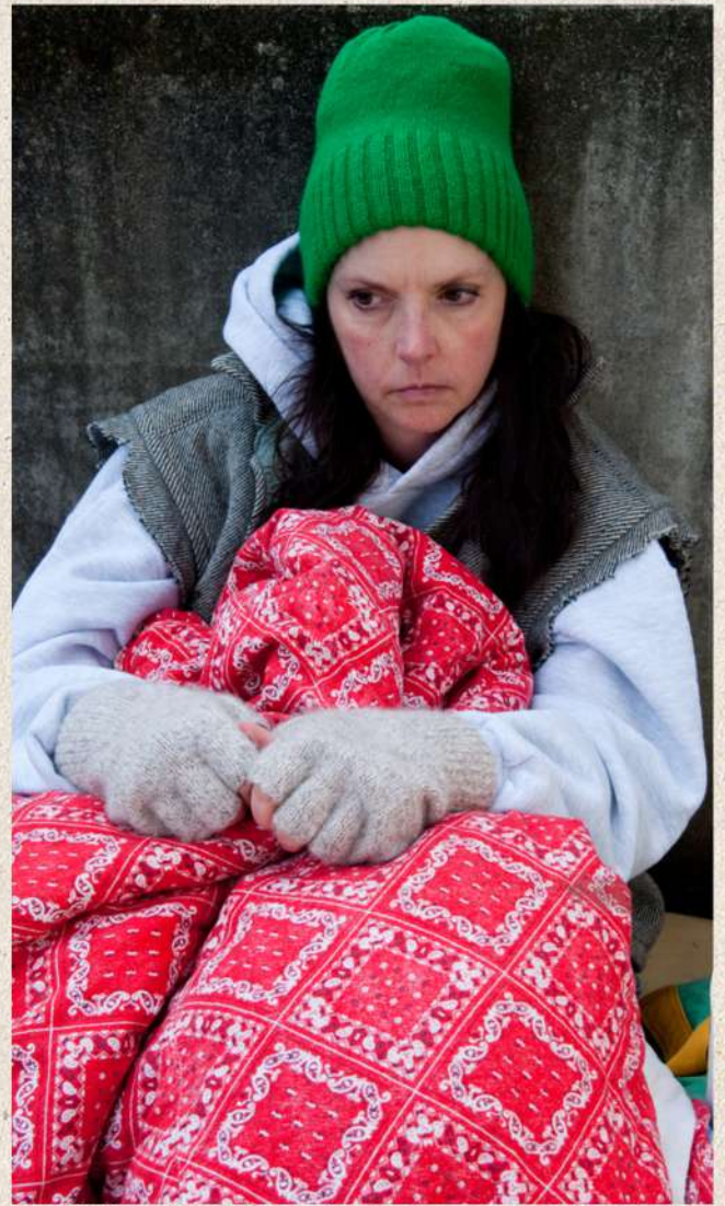
All identifying information has been changed, and a stock photo has been used to protect client privacy.

Your generosity makes stories like Angela's possible. Each gift provides more than shelter — it opens the door to restoration and new life. As we head into another cold season, we invite you to stand with us once again. Together, we can make sure no one in Salina faces winter alone.